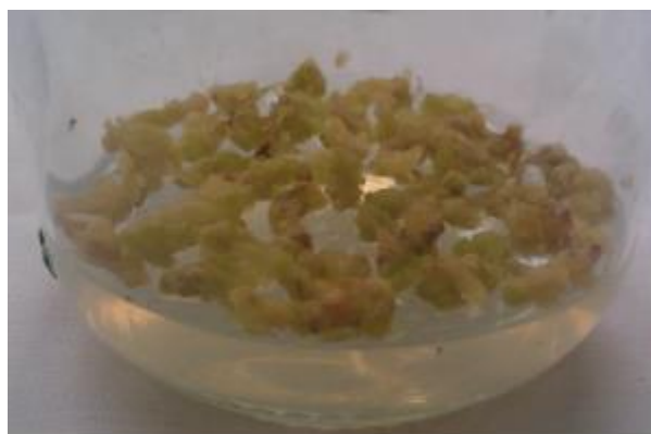
Figure 1. Callus tissue of Lallelantia iberica