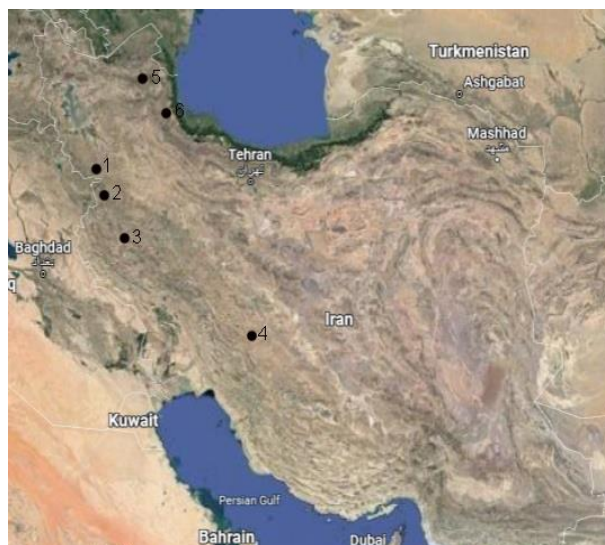
Figure 1. Locations of 1, Alyssum sp. (Baneh, serpentine) at N 36.0137 and E 45.5823; 2, A. inflatum (Marivan, serpentine) at N 35.2290 and E 46.4623; 3, A. bracteatum (Harsin, serpentine) at N 34.2709 and E 47.5134; 4, A. bracteatum (Semirom, non-serpentine) at N 31.6482 and E 51.7325; 5, A. bracteatum (Meshkin Shahr, non-serpentine) at N 38.3589 and E 47.6817; and 6, Alyssum sp. (Khalkhal, non-serpentine) at N 37.6030 and E 48.5134.

Measurement of catalase activity in mature leaves was achieved with the method developed by Aebi (1983), and concentrations of photosynthetic pigments, including chlorophyll a, chlorophyll b and carotenoids were determined based on Lichtenthaler and Buschmann, 2001. Total extractable protein was measured by quantitative protein-dye (coomassie brilliant blue G-250) binding method (Bradford, 1976). The concentration of nickel in the shoot was determined based on acid and oxidant ( H_2O_2 ) digestion and measurement by AAS (atomic absorption spectrophotometry, AAS-6200, Shimadzu Corporation, Chiyoda-ku, Tokyo, Japan) (Reeves et al. , 1999).