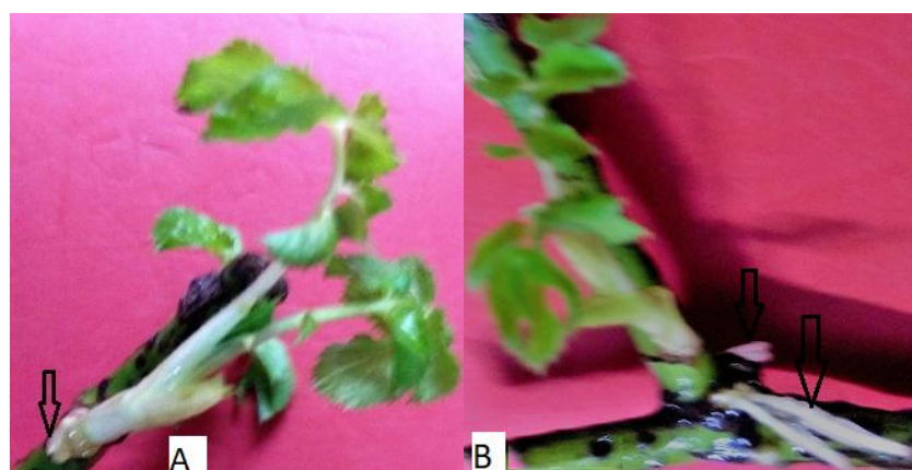
Figure 1. Shoot and root formation in T03 (0.1 \text{mg l}^{-1} IAA + 1 \text{mg l}^{-1} VB1): A- Root formation starting after third weeks. B- Root growth after fourth weak.