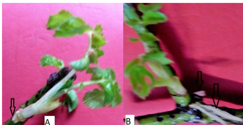
Figure 1. Shoot and root formation in T03 (0.1 \text{mg l}^{-1} IAA + 1 \text{mg l}^{-1} VB1): A- Root formation starting after third weeks. B- Root growth after fourth weak.