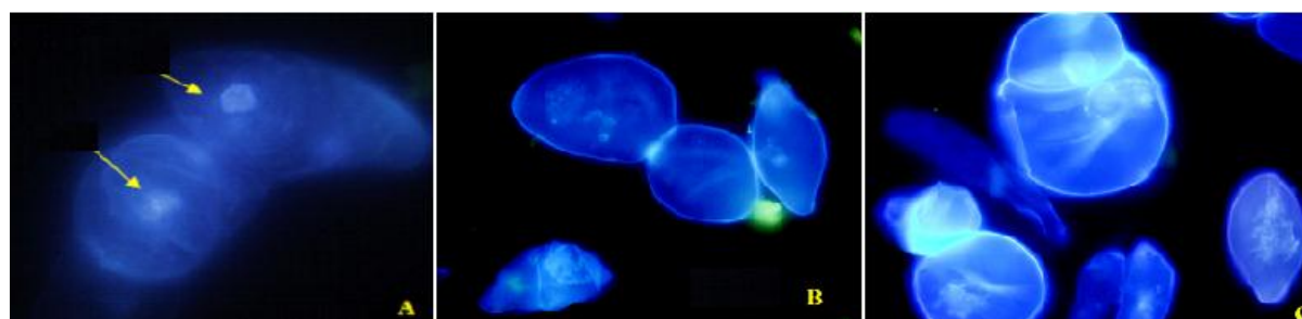
Fig. 1 Morphology of the cells nuclei stained with Hoechst A) controls, nuclei appeared large and no nuclear breakage was observed (arrows) B) nuclei of the cells treated with 100 mM sodium nitroprusside for 3 days. C) nuclei of the cells treated with 200 mM sodium nitroprusside for 3 days. (Magnification 40X).

Values are means \pm SD. Mean different letter codes in a column are significantly different (One way ANOVA, Duncan test, p < 0.05 ).